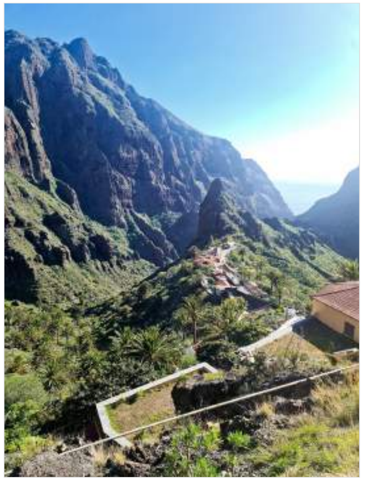
Tour of the city