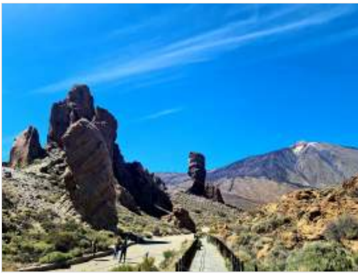
Puerto Cruz e Teide