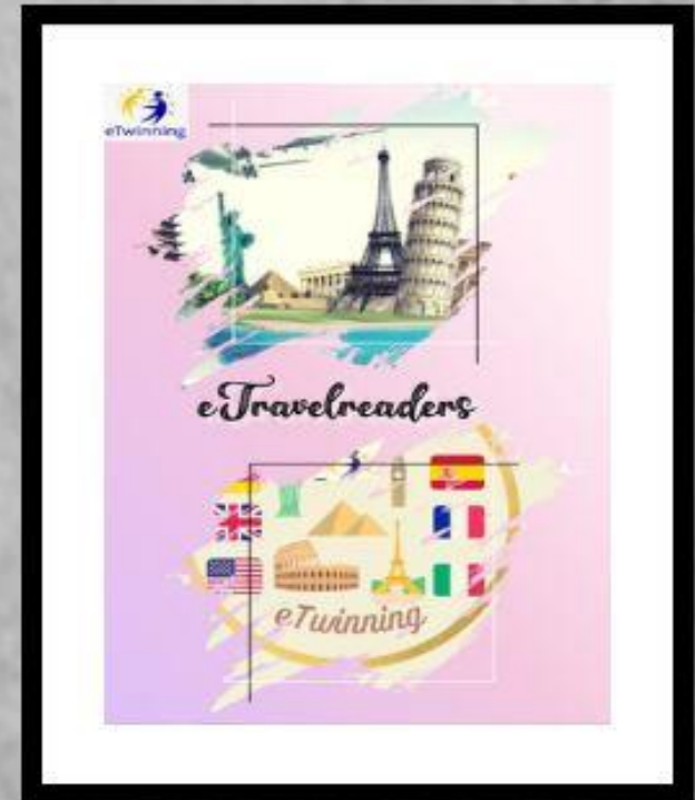
1D & 1E POSTER